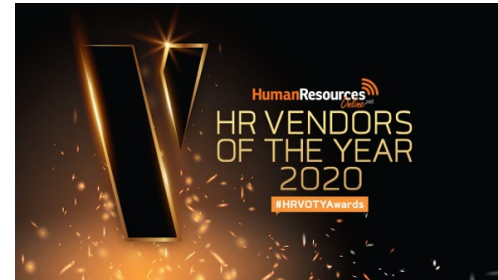
HR Vendors - Singapore Best Employee Insurance Provider 2018-2020