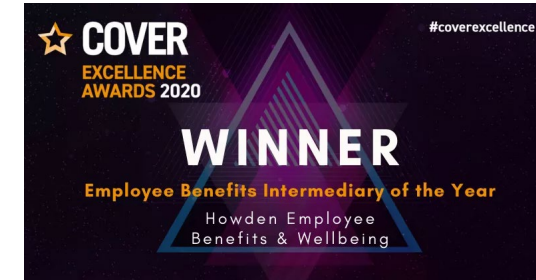
Cover Excellence HEBW – Employee Benefits Intermediary of the Year 2020