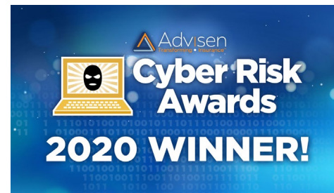
Advisen Cyber Risk Retail Team of the Year 2020