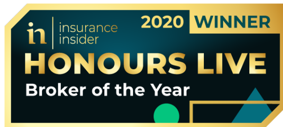
Insurance Insider Broker of the Year 2020